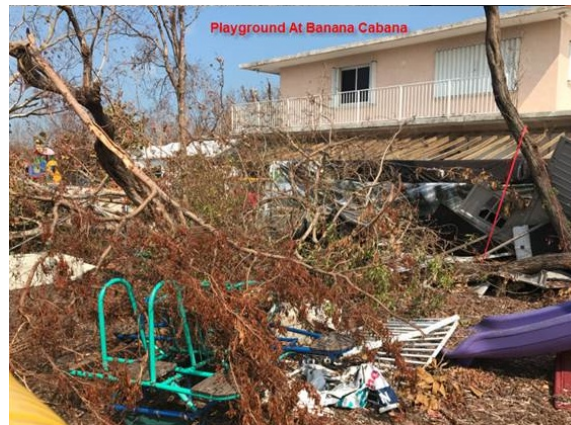
The picture above shows damage to a preschool located in the lower Florida Keys area.

However, despite the devastation the hurricane left behind, coalition staff around the state have been working diligently to recover and have quickly made adjustments, temporary relocations and other efforts to return to assisting families as quickly as possible. Child care locations that are currently inoperable are also receiving assistance to help rebuild.