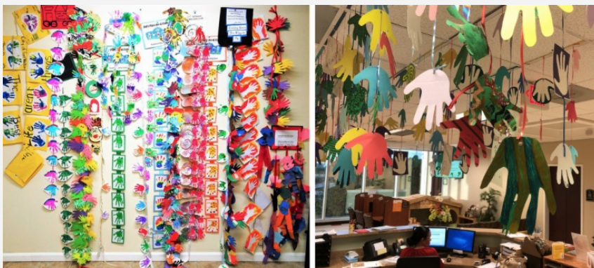
(L) Photo of artwork from the ELC of Okaloosa & Walton Counties. (R) Photo of hands hanging in the office of the ELC of Southwest Florida.

Counties are already preparing for Children's Week, Jan. 21-27, 2018. Both coalitions have received hand artwork, which will be sent to Tallahassee to be displayed in the Florida Capitol building during the annual "Hanging of the Hands" event on Sunday, Jan. 21. The ELC of Southwest Florida has also decorated their lobby and prepared flyers to inform parents and providers about the event.