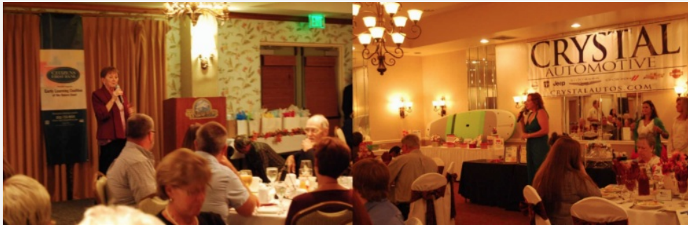
Photos from the coalition's November 2017 fundraising events.